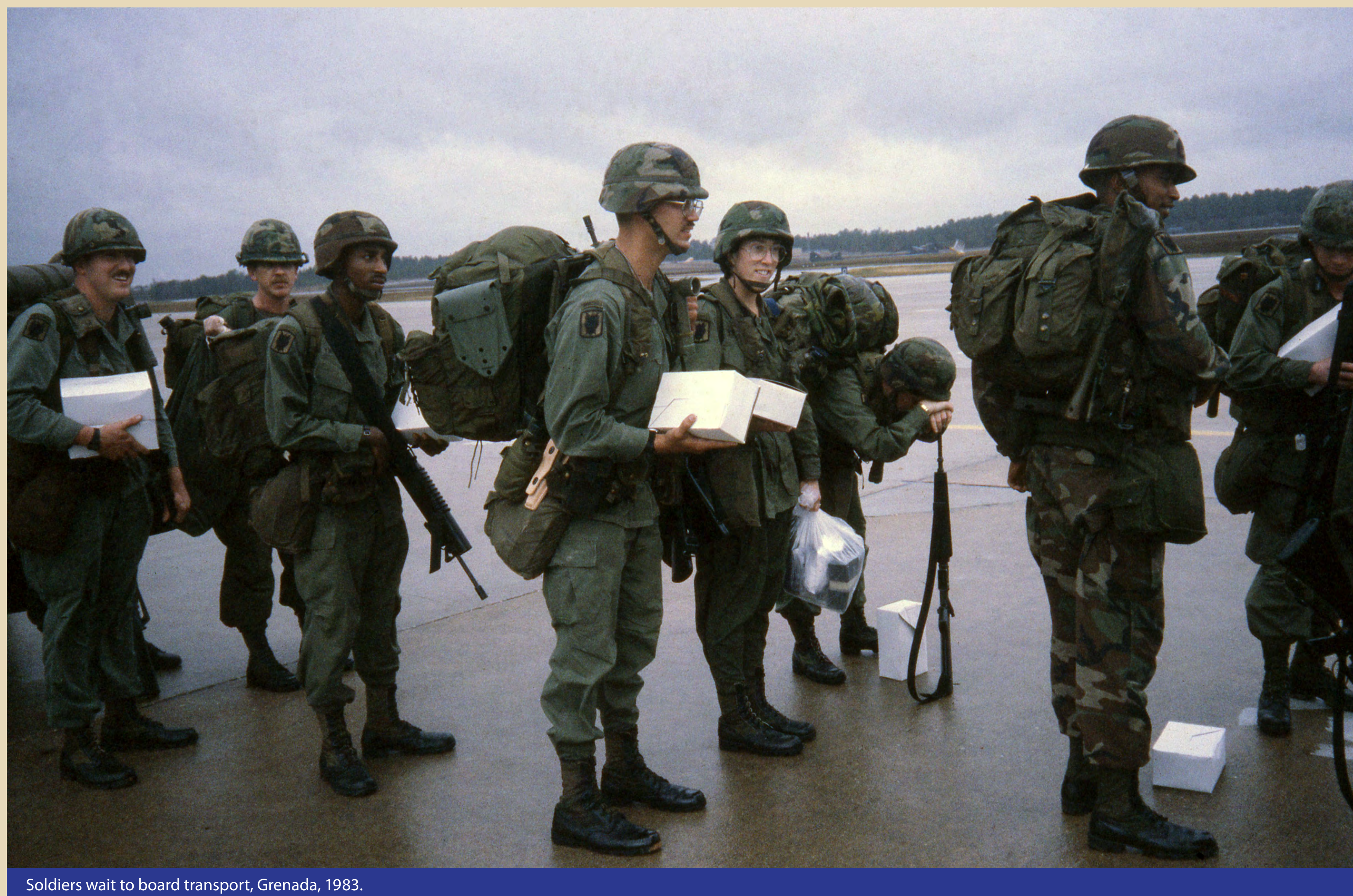
Soldiers wait to board transport, Grenada, 1983.